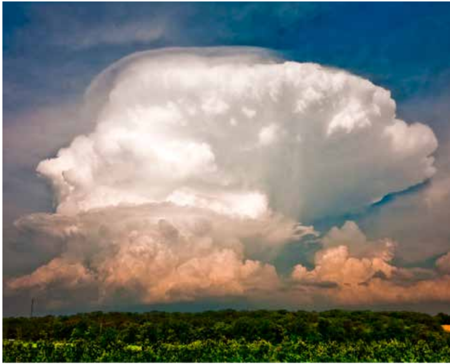
Growing cumulonimbus over southern Wisconsin in May 2011.